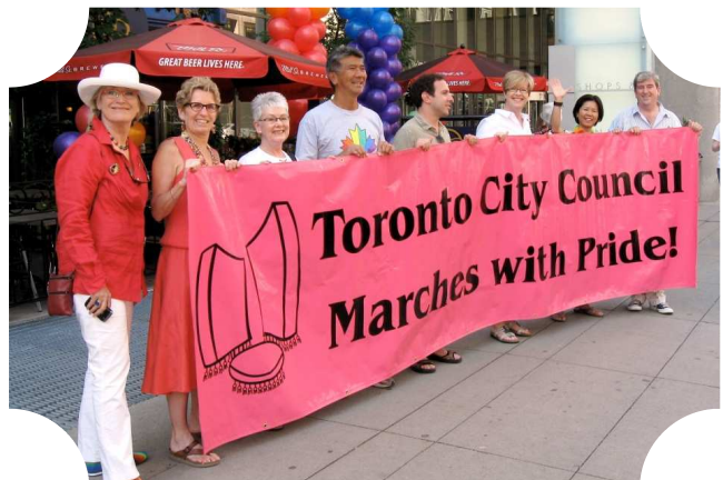
2011 Pride Parade