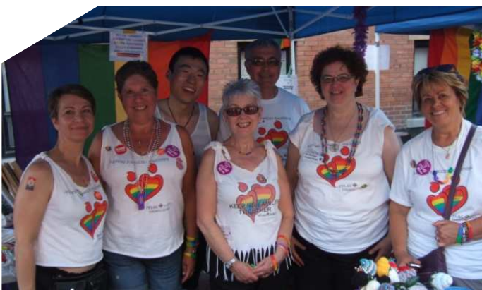
At the PFLAG Toronto booth

Kimbourne Park United Church 200 Wolverleigh Blvd., Toronto, ON M4C 1S2