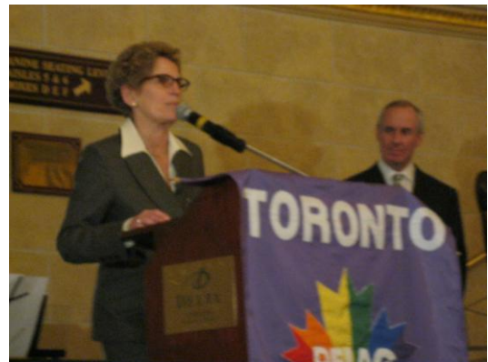
Kathleen Wynne, at the Brian Burke Award Reception 2012